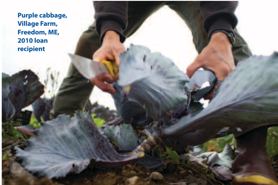
Purple cabbage, Village Farm, Freedom, ME, 2010 loan recipient

Vermont has an excellent network of technical service providers that are well coordinated and aware of one another's strengths. Vermont also has a variety of training programs and classes designed for different types of farm businesses at different stages of operation. Almost all applicants from Vermont have been "investment ready," meaning we've needed to provide very little technical assistance.