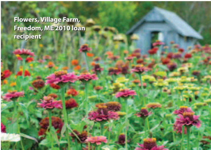
Flowers, Village Farm, Freedom, ME 2010 loan recipient