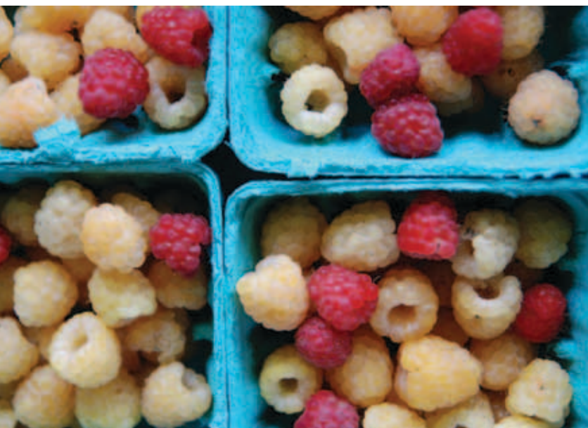
Red and yellow raspberries, Bug Hill Farm, Ashfield, MA, 2010 loan recipient

Availability of capital is important across the three kinds of capital needed to operate a loan program—operating, lending/loan, and risk. In a business, operating capital is generated from the business activities; for non-profits, charitable contributions play a significant role (although there are opportunities to generate some revenue when providing financing). Loan capital